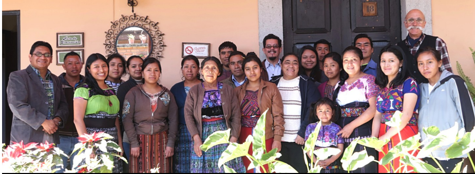
New students, their parents and our office staff during our workshop in Xela

We are very proud of the service we provide to our students but we are always looking for ways to improve. Last year as part of our indepth analysis we interviewed students and