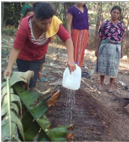
Women planting their family gardens during Rosa’s workshop.